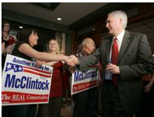
State Sen. Tom McClintock greets a supporter on Tuesday, June 3, 2008.

Pragmatic Republicans who voted for the farm bill defend themselves privately by claiming GOP voters send mixed signals, saying they want smaller government while also pressing for federal largesse. But is that still the case following the egregious spending excesses of the Bush years, and the victory of John McCain, an antipork candidate, in presidential primaries?